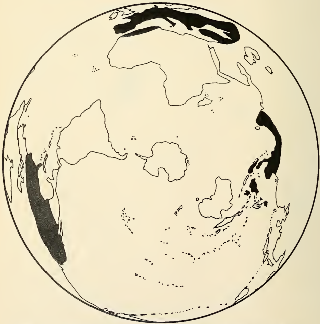
Fig. 6. Distribution of the living members of the family Pelobatidae.

Ranidae. This is a large, modern family containing many genera and hundreds of species. It is centered in Africa, where six of the seven subfamilies occur; four of them are found no place else. One subfamily is confined to the Seychelles Islands north of Madagascar. Another extends from Africa across southern Asia to the northern coast of Australia. The subfamily Raninae includes several genera of local distribution in Africa and southern Asia and the cosmopolitan genus Rana which has spread from Africa through Europe, Asia, and North America and has reached the northern parts of Australia and South America. Figure 7 shows the distribution of the Ranidae except for Rana .